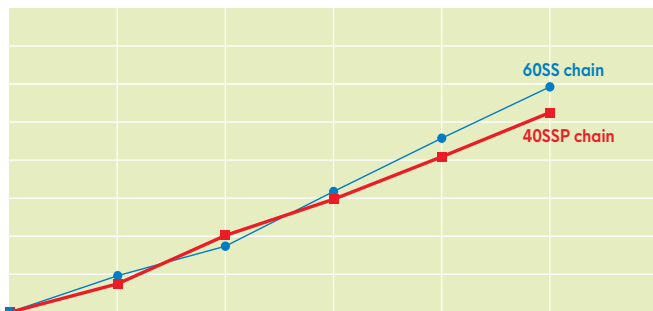
Condition: load at 1030N (maximum allowable tension for 60SS)

● Comparison between 40SSP and 60SS (unlubricated)